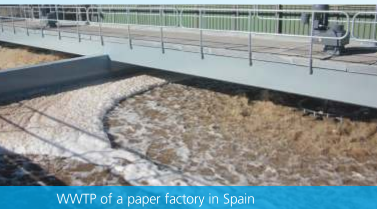
WWTP of a paper factory in Spain

BSK® surface aerators are available with different diameters for adjustable O 2 input capacities (see table) according to specific project conditions.