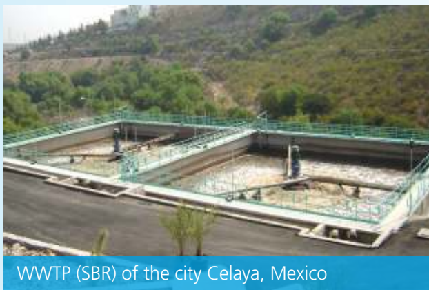
WWTP (SBR) of the city Celaya, Mexico

Depending on the individual application, BSK®-Turbines can be operated as fixed or floating systems. We offer different shapes for the floating construction to suit site specific requirements. The floating turbines are preferably used in combination with the SBR process.