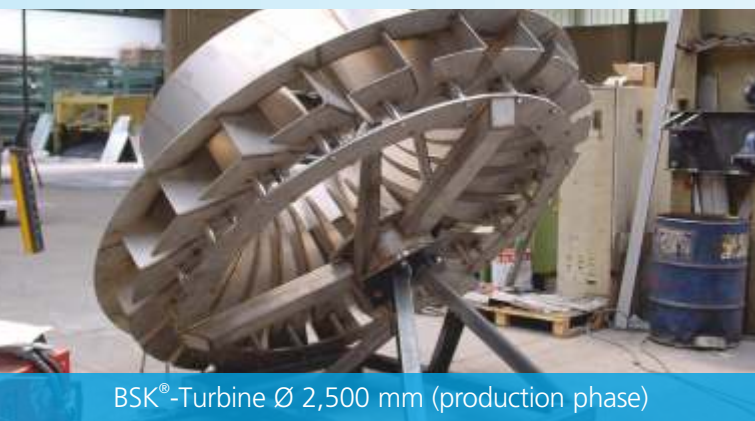
BSK®-Turbine Ø 2,500 mm (production phase)

specific project requirements and operation conditions. Thus, we offer our utmost support to customers and consultants with respect to an optimized correspondence of BSK® equipment and the design of aeration tanks, sludge stabilization reactors, buffer-tanks and similar applications.