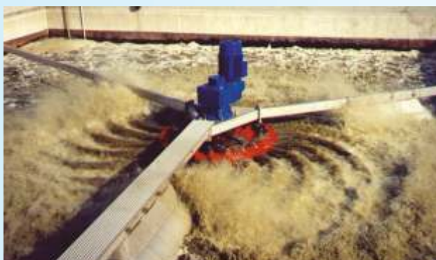
Floating BSK®-Turbine (WWTP Krzyz, Poland)

It is well known, that the aeration system of a wastewater treatment plant is the largest power consumer on site. Consequently, it is important to reduce the energy consumption to the lowest possible level. As a result, the efficiency of aeration systems is an important matter concerning the long-term energy balance. BSK®-Turbines play an important part in fulfilling this objective.