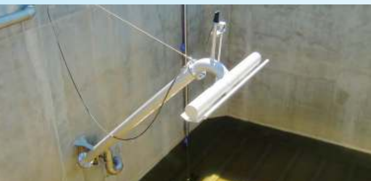
BSK®-Decanter of the WWTP Stepanovićevo (Serbia)